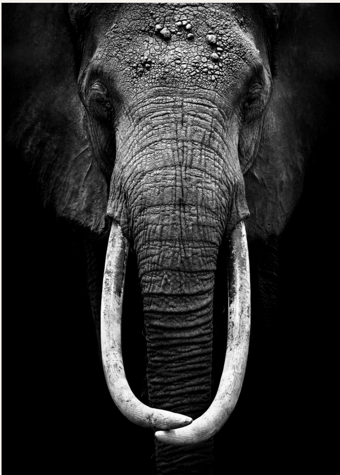
MATRIARCA, AMBOSELI, KENYA