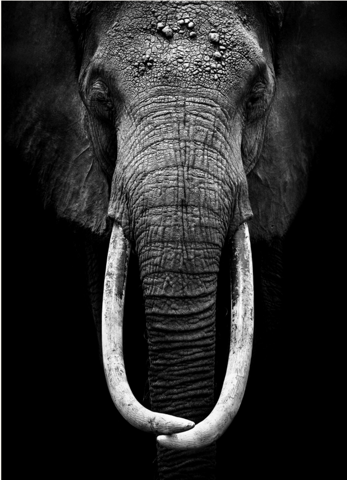
MATRIARCA, AMBOSELI, KENYA