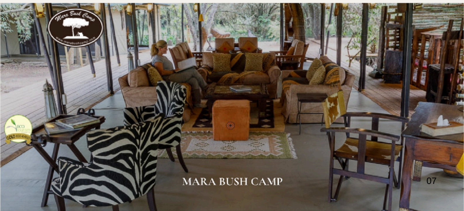
MARA BUSH CAMP

This camp is located within the 'big cat territory' and near key migration crossing points, providing year-round wildlife encounters.