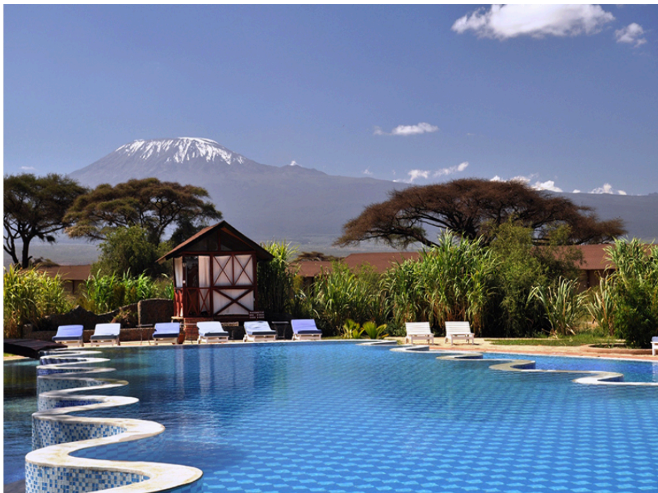
Mt. Kilimanjaro view

While in Amboseli we will stay IN THE KILIMA SAFARI CAMP where you can enjoy great game viewing from the tents which face the animal water pools and all public areas and guest rooms are set towards Mount Kilimanjaro.